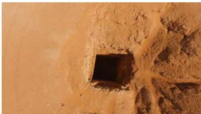
Figure (7) Picture of the pond