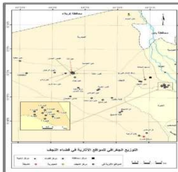
Figure (2) Map of Iraq showing the location of Najaf Governorate in relation to Iraq)