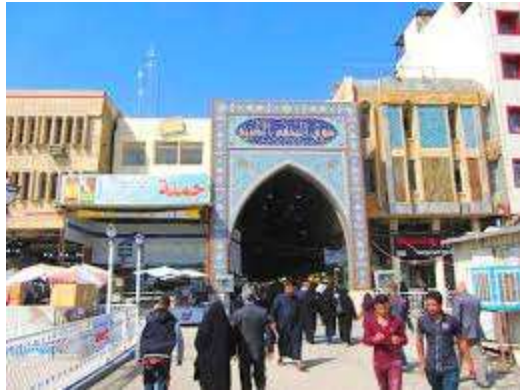
Figure No. (16) Pictures of the Grand Market in Najaf Governorate