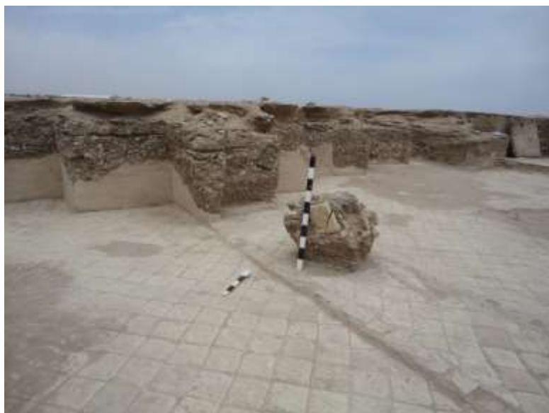
Figure No. (12) The sound of Christian antiquities in Abd al-Masih Monastery inside the walls of Najaf Al-Ashraf International Airport