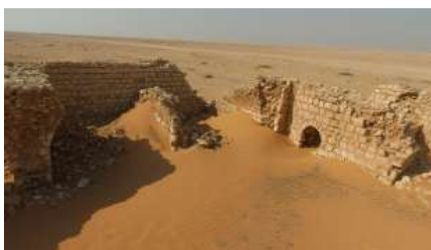
Figure No. (7) Wadi Al-Sabaa Station in Najaf Al-Ashraf Governorate