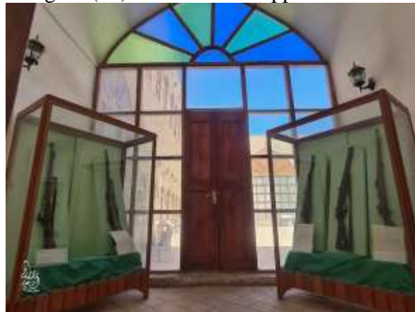
Figure No. (17) Picture of Khan Al-Sheilan