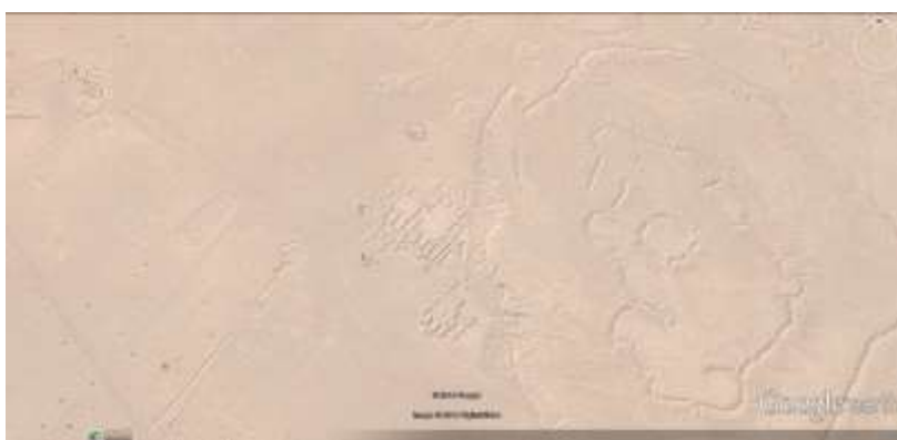
Figure No. (11) The sound of Christian antiquities in Abd al-Masih Monastery inside the walls of Najaf Al-Ashraf International Airport