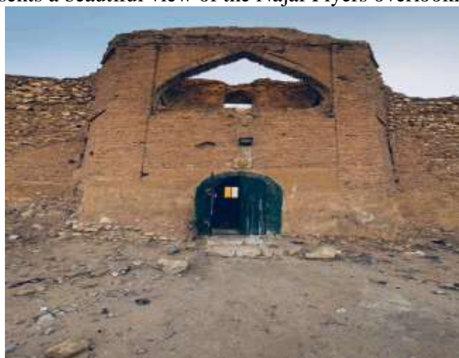
Figure (6) Picture of Khan Al-Rahba