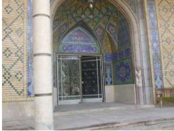
Figure No. (18) Picture of Al-Yazdi School