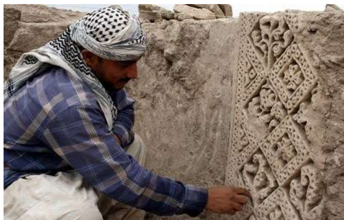
Figure No. (10) The Sound of Christian Antiquities in Abd al-Masih Monastery