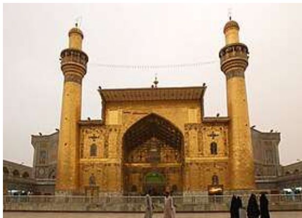
Figure (16) Picture of the upper threshold