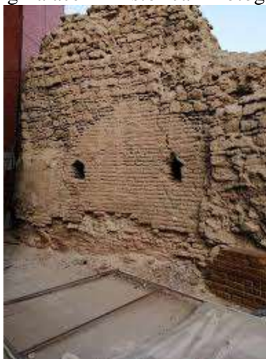
Figure No. (15) The remaining part of the wall of Najaf