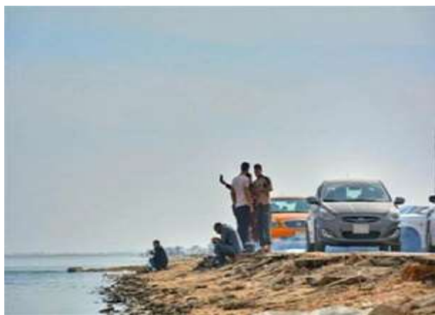
Figure (3) and (4) Picture of the Najaf Sea in Najaf Governorate