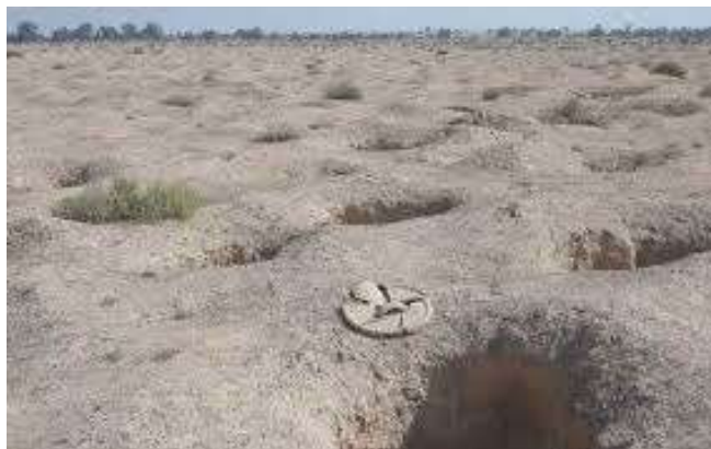
Figure No. (13) Picture of um Khashm Cemetery today after the theft