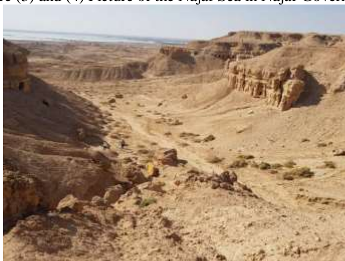
Figure (5) represents a beautiful view of the Najaf Flyers overlooking the Najaf Sea.